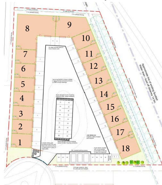
Indicative Site Layout

COSTS: Each party will bear their own legal costs. The incoming tenant will be liable for any LBTT, Registration Dues and VAT thereon.